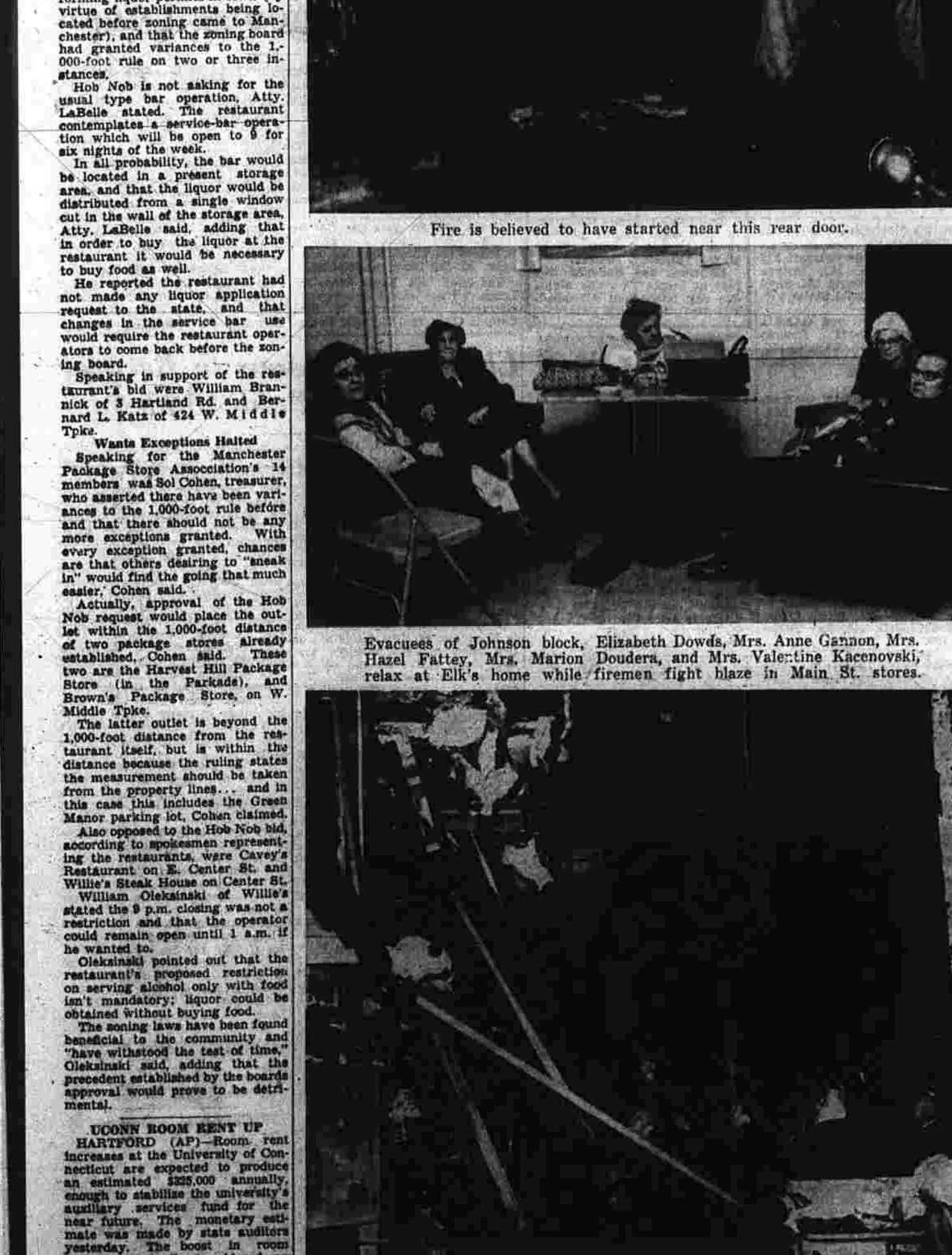
Making sure the fire isn't smouldering in the ceiling